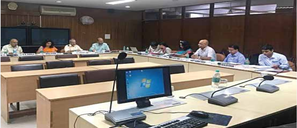
Peer Review Meeting of the Authors of IHER 2020

authors of the IHER 2020 was held on 26 September, 2019. The CPRHE prepared extensive review comments and shared among the authors for revision of their papers. The report is under preparation to be published by Sage. The CPRHE also plans to prepare the next issue of India Higher Education Report 2021 (IHER 2021) on the theme 'Private Higher Education in India'.