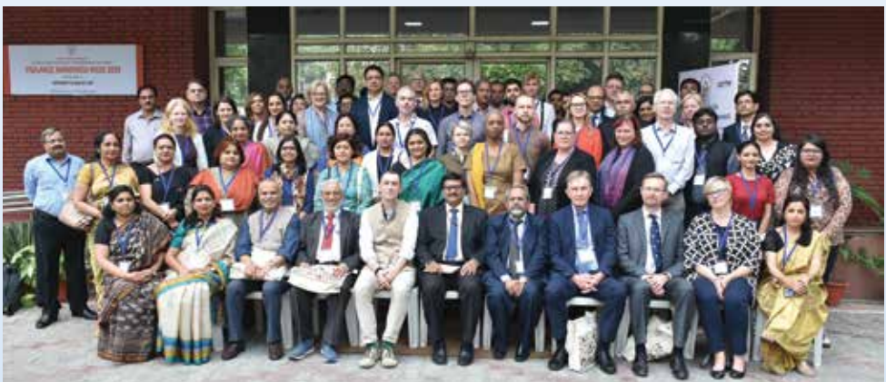
Delegates of the Nordic-India Higher Education Summit on 'Internationalisation for Improving Access, Equity and Sustainability in Higher Education'

Across nations, higher education institutions are increasingly being expected to contribute to internationalisation of higher education and research. In India, internationalisation is considered as a way through which universities can address local and global challenges and in preparing students to contribute to economic development both within India and outside. There is a growing emphasis on international collaborations which focuses on equitable and balanced student mobility, research in socially relevant areas, and promoting quality education. These collaborations may include (and are not limited to) structuring of curriculum to suit contemporary needs, improving pedagogical skills and promoting innovations in learning as well as engaging in international best practices for managing higher education through capacity building and training of faculty and educational administrators.