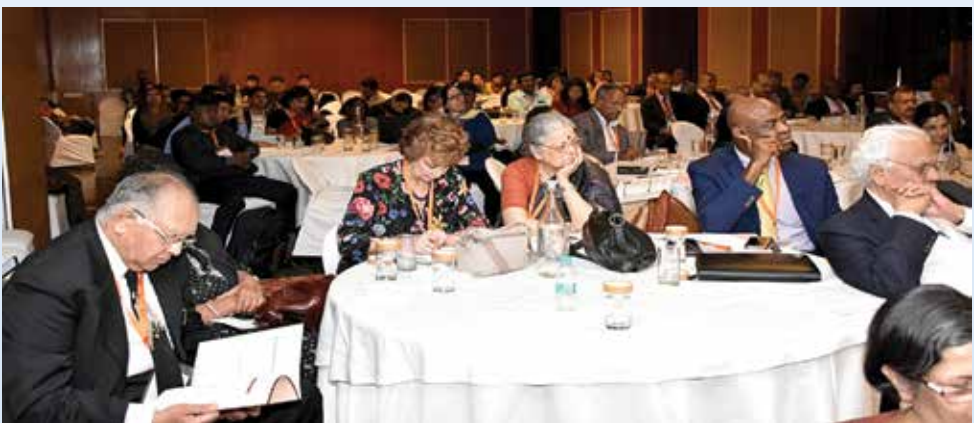
A cross-section of delegates at the International Seminar on 'Governance and Autonomy in Higher Education'

The Centre for Policy Research in Higher Education (CPRHE) of the National Institute of Educational Planning and Administration (NIEPA), New Delhi and the British Council, jointly organised this International Seminar titled 'Governance and Autonomy in Higher Education' to discuss the international trends in governance of higher education; share country experiences in institutional autonomy and provide a platform to share strategies for improving institutional performance.