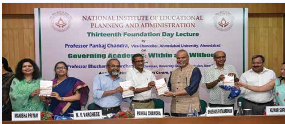
Releasing the ‘India Higher Education Report 2018: Financing of Higher Education’ at the NIEPA’s Thirteenth Foundation Day Lecture

The third India Higher Education Report 2017 (IHER 2017) focuses on ‘Teaching, Learning and Quality’. It was published by Sage in 2018 and released at the NIEPA’s Twelfth Foundation Day Lecture in August 2018.