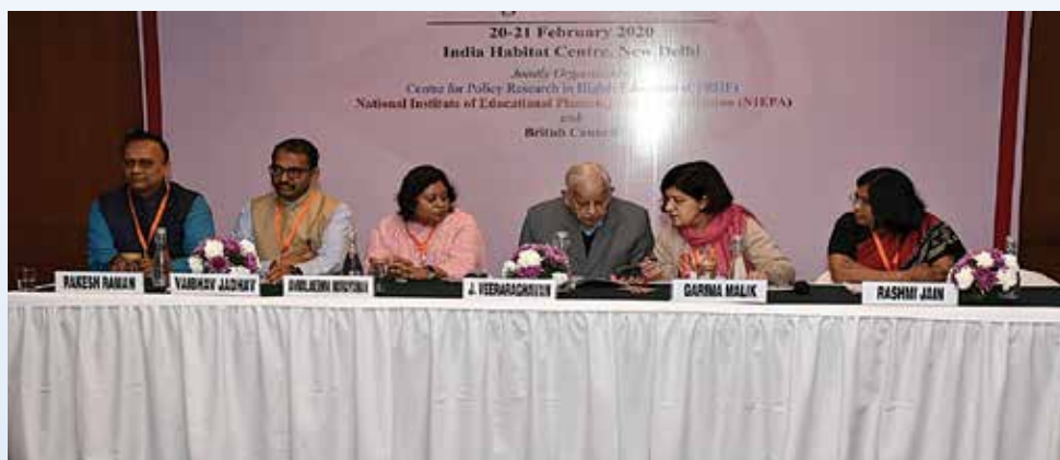
The CPRHE Panel at the International Seminar on 'Governance and Autonomy in Higher Education'