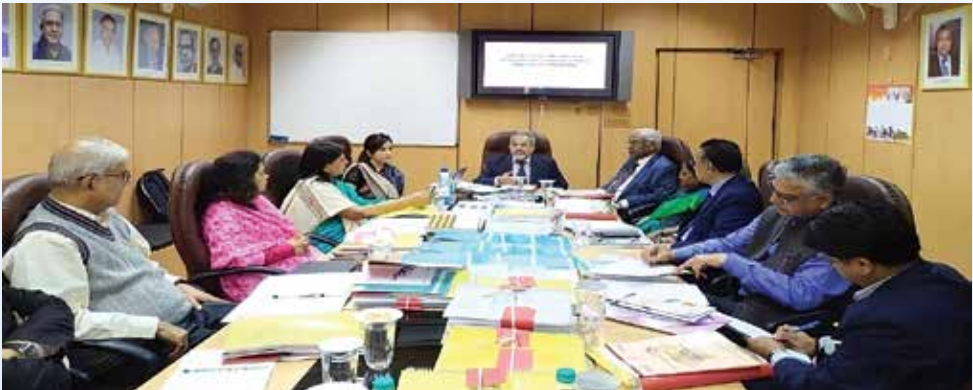
Executive Committee Meeting of the Centre for Policy Research in Higher Education